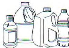
Plastic Bottles and Containers #1-7 (Botellas de plástico y recipientes #1-7)