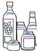
Glass Bottles Jars (Envases y Botellas de Vidrio)