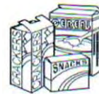
Paperboard, Milk and Juice Carton (Envases de carton de lácteos y jugos)