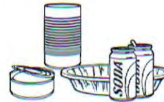
Aluminum Cans & Foil (Papel & Latas de Aluminio) Aerosol Spray Cans, Tin & Steel Cans (Latas Vacias de Aerosoles, Fierro y Estaño)