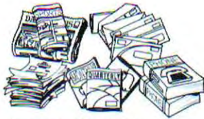
Newspapers (Periodicos) Magazines (Revistas) Junk Mail (Desperdicio de Correo) Phone Books (Libros Telefonicos) Office Paper (Papel de Oficina)

This means you can put all your recyclables together in one cart, no sorting needed! Use your green cart with the yellow lid to place all your standard recyclables together. Place your cart at the curb after 12 noon the day before collection or by 6:00 a.m. on your collection day. Your cart must be removed from the curb by noon the day after collection.